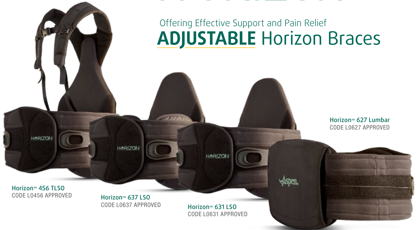
Horizon™ 456 TLSO CODE L0456 APPROVED