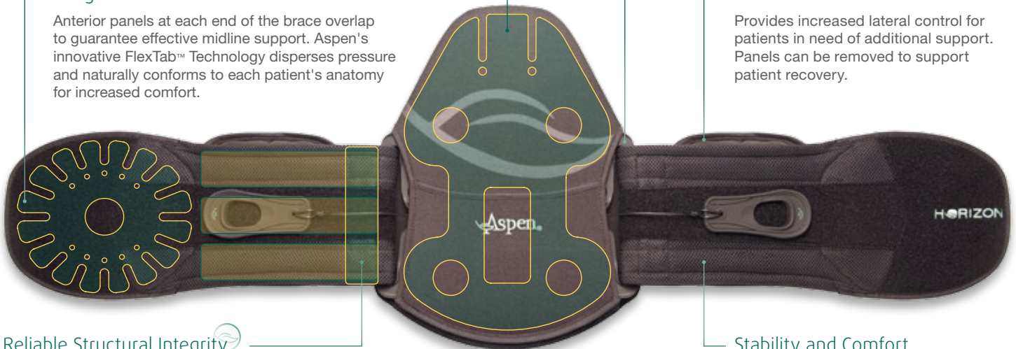
*Horizon 637 LSO shown in smallest configuration

Provides increased lateral control for patients in need of additional support. Panels can be removed to support patient recovery.